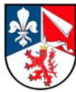
Čechy pod Kosířem